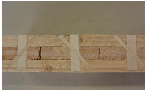
Cross section view showing 1 ¼” dowel and locking ½” cross dowel.

Our patent pending cross doweled access mats have undergone hours of rigorous testing. Stressing the mats beyond what the average mat goes through in real life, on the job situations. We tested them alongside the standard bolted mats, until both the bolted and doweled mats failed in their cores. The boards were cracking and breaking up, but the cross dowels held. Through the durability testing we learned valuable information on how we could make our mats even more durable. We have applied this knowledge to bolted and doweled mats alike, giving our clients the best product possible. Clips of the hours of testing can be viewed on our website at www.Rigmats.ca & www.Duzcho.com